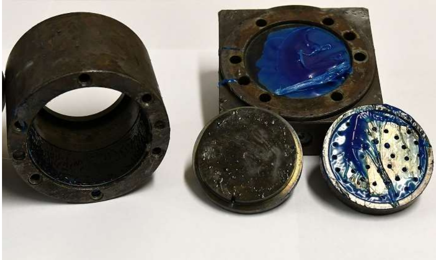
Machine parts of the Institute of Textile Technology ITA before thermal cleaning