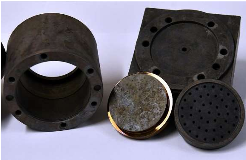
Machine parts of the Institute of Textile Technology ITA after thermal cleaning

Download: https://drive.google.com/file/d/1InViseBfgqEFKes4FjKbcV6WJFuSoB4f/view?usp=sharing